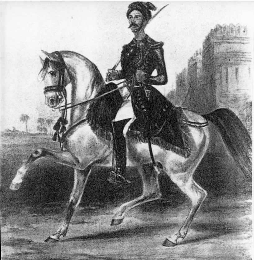
Figure 3 Cavalry officer of the Hyderabad Contingent, 1846.

constituted. Besides, a faqīr who was known to regularly ruin the careers and livelihoods of his followers was scarcely likely to attract new recruits to his own service!